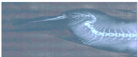
Figure 6b: Enlarged x-ray photograph of post dorsal region of deformed Schizothorichthys esocinus (Heckel).

more towards the caudal fin base than the snout. Like a normal fish there is a wide space between the extension of the longest pectoral fin ray and pelvic fin origin and extension of the longest pelvic fin ray and anal fin origin. In a normal fish, there is a wide gap between longest anal fin ray extension and caudal fin base and caudal fin is bilobed. On the contrary, in this deformed specimen of Schizothorichthys esocinus caudal peduncle is short, caudal fin lobes overlap and is not well demarcated and longest anal fin ray extends beyond the caudal fin base (Figure 5). There are some deviations in various body ratios of the normal and abnormal fish.