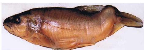
Figure 5: Photograph of Schizothorichthys esocinus (Heckel) showing post dorsal truncated body, a trough, a dome and anal bulge in the caudal peduncle region.