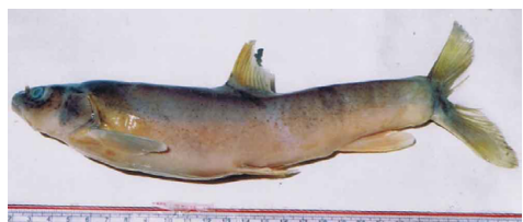
Figure 3: Photograph of Schizothorichthys esocinus (Heckel) showing flat caudal peduncle and widely spaced caudal fin lobes.