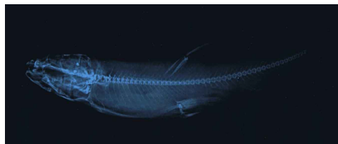
Figure 2: X-ray photograph of a normal specimen of Schizothorichthys esocinus (Heckel).