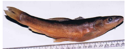
Figure 1: Photograph of a normal specimen of Schizothorichthys esocinus (Heckel).

In a normal streamlined fish placement of dorsal fin is more towards the snout than the caudal fin base (Figure 1). In this aberrant fish, measuring 18 cm and weighing 85 g, placement of dorsal fin is