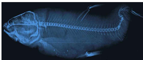
Figure 6a: X-ray photograph of Schizothorichthys esocinus (Heckel) showing post dorsal truncated body, a trough, a dome and anal bulge in the caudal peduncle region.