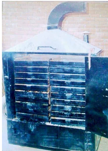
Figure 1: The Fish Smoking kiln.