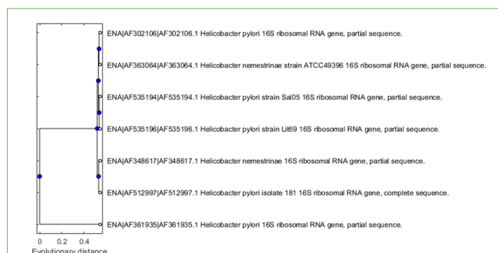
Figure 2: Phylogenetic tree of 16S rRNA gene of different strains of H. pylori . The data shows that there is little sequence divergence between different strains of H. pylori except for one outlier strain, which indicates that 16S rRNA gene could not be used to describe the phylogeny of different strains of H. pylori .

Phylogenetic tree analysis as depicted in Figure 2 reveals high level of similarity in the 16S rRNA gene of different strains of H. pylori . This comes about from the close evolutionary relationships between different strains of the species except for one outlier strain. Combining the results from multiple sequence alignment and phylogenetic tree analysis reveals that 16S rRNA gene is not a good candidate for describing the phylogeny of different strains of H. pylori .