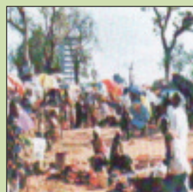
Open market in Abuja

There is a range of hotels spanning those with 5-star status to budget outlets. Full information will be available on the congress website that can be accessed as from 01 November 2008.