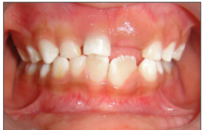
Figure 1. Front view showing large left mandibular central incisor.

An intraoral periapical (Figure 4) and mandibular occlusal radiographs (Figure 5) were taken which revealed fusion of teeth on the coronal aspect, and two separate roots in close apposition with each other. Both the radiographs revealed the fusion of crowns of the two teeth with two pulp chambers, two root canals with open apex and inverted "V" shaped