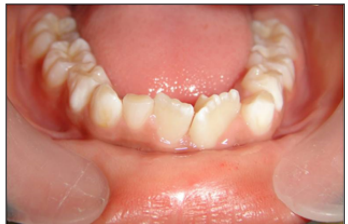
Figure 2. Front view showing fused left mandibular teeth with lingual talon cusp.