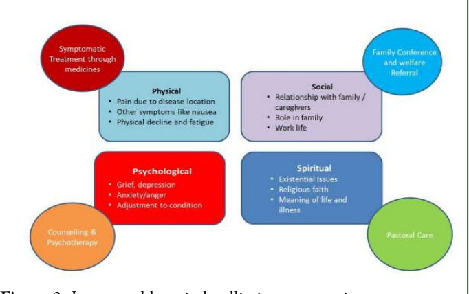
Figure 3: Integrated hospital palliative care services.

In the hospital, the patient can avail consultation services from other specialties, tertiary or acute palliative care and have access to imaging, radiotherapy and lab services and also to various other pain relieving and comfort oriented modalities (Figure 3).