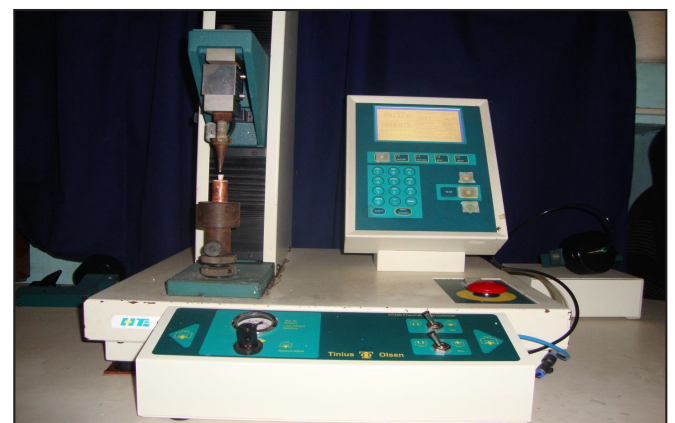
Figure 1. Study sample mounted on Universal Testing Machine (Housefield Testing Machine).

Fracture resistance of teeth of all groups (In Newton) is given in Table 1 and the mean value is given in Table 2 .