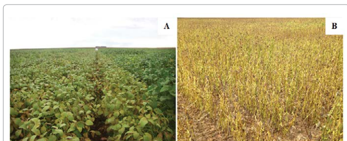
Figure 1: Soybean crop during the pod fill stage severely infected by Phakopsora pachyrhizi (A), and the same crop field a week later, presenting intense defoliation (B). Location of pictures: Campo Verde city, Mato Grosso state, Brazil, February-2010 (W55°16'30"/S15°35'6").