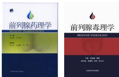
Figure 1: Monographs of Prostate Pharmacology & Prostate Toxicology